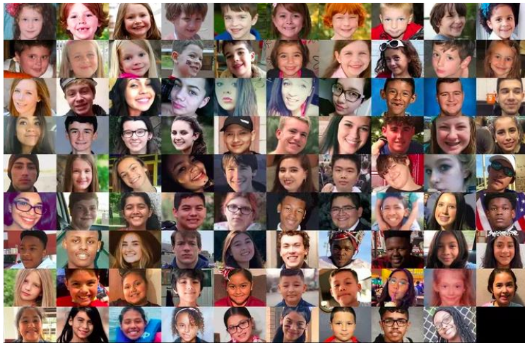
10 years of victims from 2012 to 2022